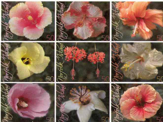
SOME OF THE HIBISCUS FLOWERS FEATURED IN THIS STAMP ISSUE.

Each stamp will be valued at 50 cents, and the set of 12 totalling $6.00. The value of the stamps is based on the postage to mainland Australia, which is where the majority of the mail is sent from the island.