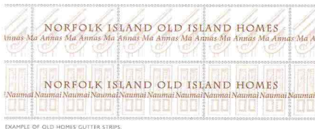
EXAMPLE OF OLD HOMES GUTTER STRIPS.

NORFOLK POST AND PHILATELIC BUREAU NORFOLK ISLAND, 2899 SOUTH PACIFIC